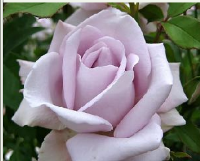
Lagerfeld Grandiflora, mauve