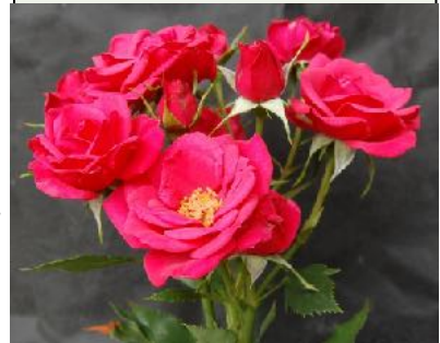
Scott Cl. Miniature, med red