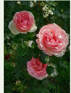
Eden Climber, pink blend