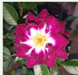
Diamond Eyes Miniature, mauve