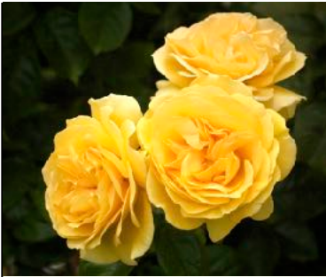
Julia Child Floribunda, med yellow