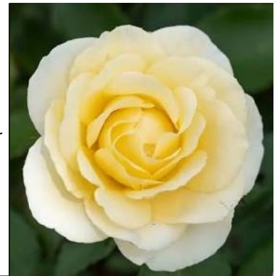
Buttercream Drift Groundcover, It

This year Rose Society members will be Rose Ambassadors in the garden. We hope to have two members in the garden to talk about the roses, the care of roses, and the Rose Society. As an ambassador, you will interact with the public and answer their many questions. No pressure. Just a relaxed and fun sharing of rose information. You can walk around the garden and chat with visitors or be available in the Rose Garden pagoda.