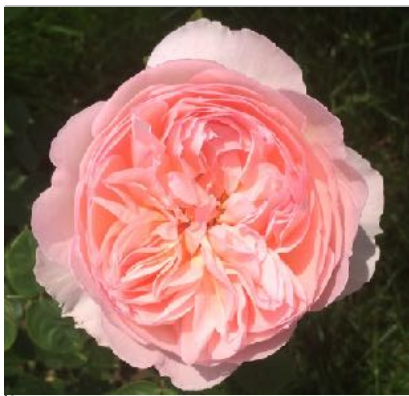
Gentle Hermione Austin, light pink