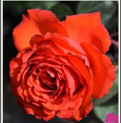
True Passion Hybrid tea, orange red