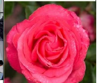
Figi Hybrid tea, deep pink