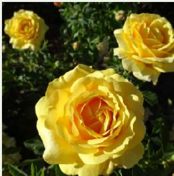
Tupelo Honey Floribunda, med yellow