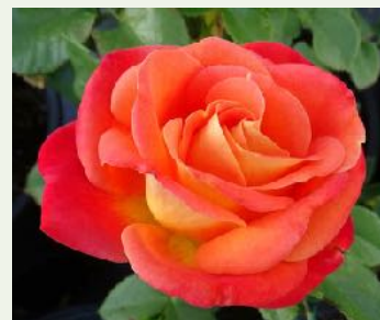
Burst of Joy Floribunda, orange blend