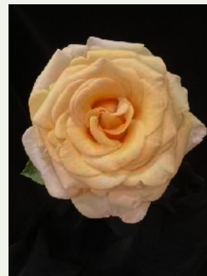
Beautiful Day Hybrid tea, apricot bl

Some roses, most donated by Raft Island Roses, for our Spring Sale.