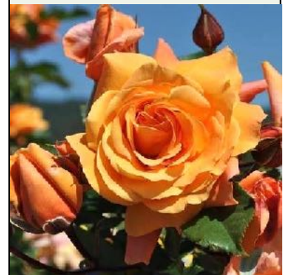
Tangerine Skies Climber, orange blend