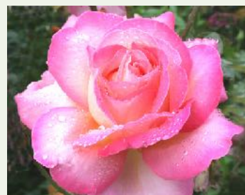
Chicago Peace Hybrid tea, pink blend