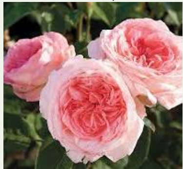
Liv Tyler Hybrid tea, med pink

using the center itself for bathroom breaks. The sale will be set up in the parking lot north of the center so please look for street parking for your vehicles. I have an order in for good weather so I hope the message was received! Bring your chair, sun hat, sun screen, water, and we will see you there!