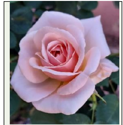
Pretty Lady Floribunda, light pink