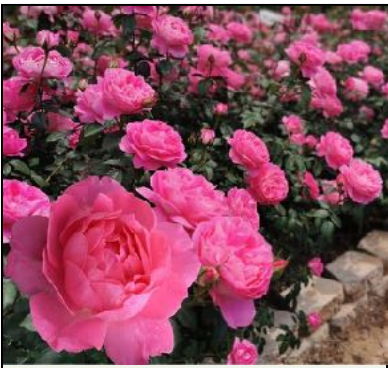
True Inspiration Hybrid tea, pink blend