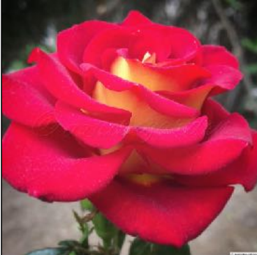
Ketchup and Mustard Floribunda, red blend

We hope to have two shifts with two persons each day of the show.