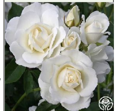
Iceberg Floribunda, white