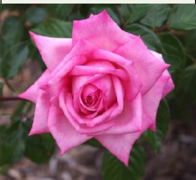
Wedding Bells Hybrid tea, pink blend