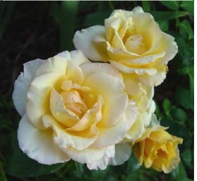
'Golden Opportunity' is a yellow climber with long canes of 10 - 12 feet. Moderate fruity fragrance, very good disease resistance