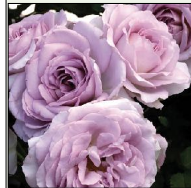
'Silver Lining' is mauve Floribunda with glossy green foliage & good disease resistance.