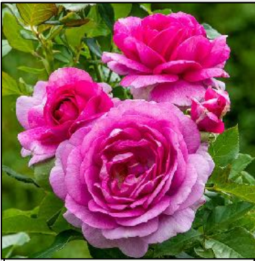
'Perfume Factory' is a mauve Hybrid Tea. Fragrance is strong fruity, with spices, good disease resistance