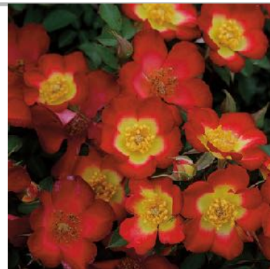
'Playful Happy Trails' is ground cover rose. Blooms are medium red with a large yellow eye. Low, trailing & spreading.