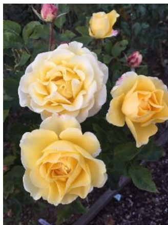
'Robert Bruce' Hybrid Tea, Med Yell