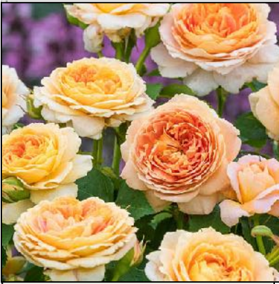
'Fun in the Sun' Fragrant apricot blend Grandiflora. Disease resistant, strong fragrance