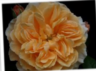
Crown Princess Margareta