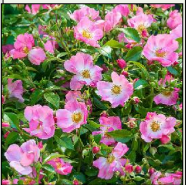
'Pink Snowflakes' is a medium pink shrub. Small blooms in large clusters, very good disease resistance.

need to be named on the entry tags. (I learned years ago that if a few roses are used, they all must be named, but within a large traditional mass, the largest percentage should be named.)