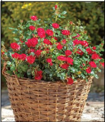
'The Petite Knock Out Rose' is the first Miniature Knock Out rose. Fire engine red, easy care, disease resistant.