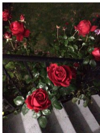
'Ingrid Bergman' Hybrid Tea, Dark red

'Grape Jelly' is a Floribunda with deep lavender to burgundy color petals. Bushy upright plant up to 5