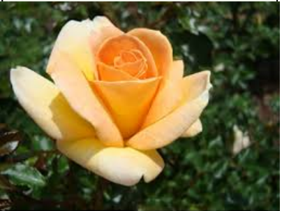
'Gayle Hammond' is a yellow blend Shrub. Extremely disease resistant.