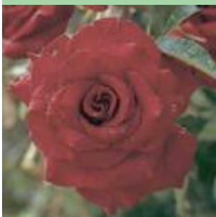
'BLACK MAGIC' HYBRID TEA

A – Yes, it sounds like you are having spider mites visiting your roses. They cause their damage by sucking the sap from the leaves starting with the lower leaves. Their fine webbing can be seen there, and sometimes very small dark spots. Because of their size, determining their presence is not easy. They would be about the same size as a dot on this page. The tops of the affected leaflets start to turn yellow and brown in a salt and pepper looking pattern. The leaves then get crispy and curl up, then can turn completely brown, die and fall off. They are extremely prolific, producing a new generation every 5 days, so they can multiply very rapidly. They dislike humidity and rain. So the first thing to try is to use your water wand, every day for a week, and blast them off paying particular attention to the undersides of the leaves. This blasting action is to disrupt their breeding cycle. They do not have wings, and must crawl from plant to plant or be blown by the wind. If this does not work, then you need to spray with a miticide like Avid or Floramite or something similar. Most insecticides will not work, as a mite is of a different family of insects.