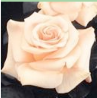
'MARILYN MONORE' HYBRID TEA

Some disappointing roses of the newer ones: 'Legends', 'Strike it Rich', 'Paradise Found', 'Change of Heart', 'Gentle Giant', 'Pink Promise', and 'Candelabra'.