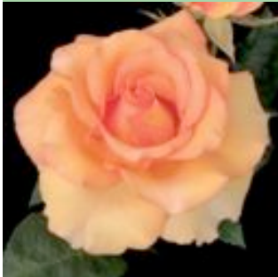
'SUNSTRUCK' HYBRID TEA

Q – It seems that my roses have stopped growing even though I have been watering them. The leaves look grayish and see some webbing on the undersides of some leaves. What can I do to get them growing again. I have heard that spider mites can be a problem at this time of the year. Is this what might be the problem with my roses?