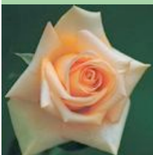
'SUNSET CELEBRATION' HYBRID TEA

A – Yes, it sounds like you need to water more, especially with the hot weather we are having. You can never over water as long as you have good drainage. You need to find a way to get more moisture to the root zone. Break up the soil – can use a spade fork and poke some holes around the bush so the water will penetrate deeper. When watering – remember to water slowly and for a longer time and more often during these hot days! Water is one of the main elements for a rose to have good substance to thrive and for survival. It's also a good time to mulch your rose beds to stop the evaporation and keep the moisture in. Quite often we only think about mulching for winter protection to keep the bud union from freezing, but mulch will help in moisture retention during the growing season. Also, most mulch is a good organic source of slow-release nitrogen fertilizer. These organic mulches improve the soil by adding nutrients as they decompose and encouraging earthworm activity. This gives a very good environment for microbes to work in breaking down the elements so the bush gets the nutrients it needs.