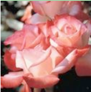
'GEMINI' HYBRID TEA