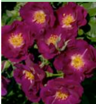
'NIGHT OWL' CLIMBER