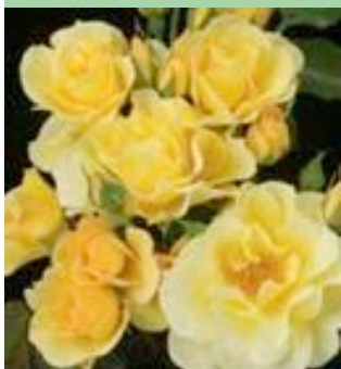
'SKY'S THE LIMIT' CLIMBER

what our hobby is all about – and at the same time hopefully generate renewed interest among the public in becoming part of us.