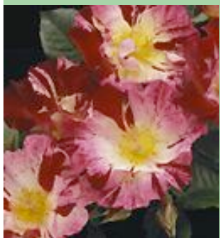
'FOURTH OF JULY' CLIMBER

A –Alfalfa is considered a natural yet fairly inexpensive fertilizer, as it is a good slow-release source of nitrogen. Available as pellets or meal from most feed supply stores in 50 lb. bags, pellets are easier to handle, but meal is quicker acting, as it doesn't have to break down as much to be useful to the plant. Alfalfa contains triacontanol, a naturally occurring plant hormone that acts as a growth promoter, which for many plants, most notably roses, where it rapidly increases the number of basal breaks. It also raises plant yield by improving photosynthesis and cell division. In addition to nitrogen, alfalfa supplies a lot of other ingredients and trace elements that generally are not present in chemical nitrogen fertilizers. You should see growth and stronger stems within a week.