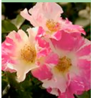
'SOARING SPIRITS' CLIMBER