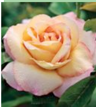
'PEACE' HYBRID TEA