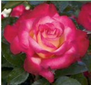
'DICK CLARK' GRANDIFLORA AARS 2011

It is time once again for the annual summer deadheading at the Point Defiance Rose Garden, and YOU ARE INVITED to join your fellow Tacoma Rose Society members each Thursday afternoon at the garden, starting Thursday, June 24 th and continuing each Thursday thereafter through September 9 th . The time is 4:30 to 6:30 (or until finished), but it is not necessary to arrive right at 4:30; come when you can and join in the fun and camaraderie of deadheading the roses in the main garden as well as those in the nearby miniature/wishing well garden. You will find that it is a great way to spend a summer afternoon while performing a community service at the same time.