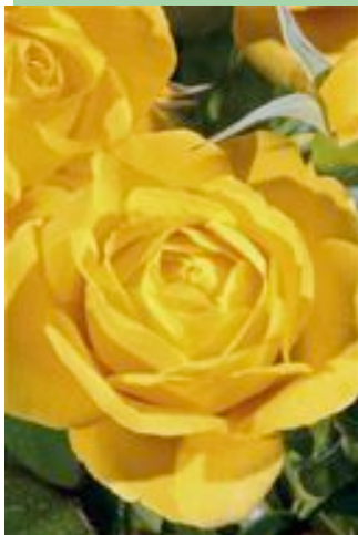
'WALKING ON SUNSHINE' FLORIBUNDA AARS 2011

'Walking on Sunshine' is a floribunda introduced by Jackson & Perkins and hybridized by Keith Zary. Its flowers are tight clusters of bright yellow blooms with anise fragrance. Its light yellow outer petals and attractive fade give a multi-tonal effect. It has fantastic bloom production and plant vigor. It has a very attractive rounded habit with medium green super glossy disease resistant foliage. And it is easy to care for – great for beginners. (Sequoia Gold X Baby Love) X (unnamed seedling x Amber Queen)