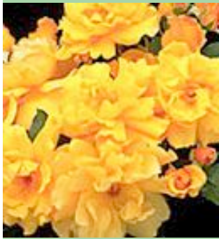
'AUTUMN SUNSET' CLIMBER