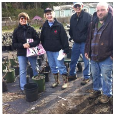
TIME TO SELECT AND BUY THOSE NEW ROSE BUSHES.

CLIMBER HT: CANES 10' – 14' BLOOMS: MED-LG IN LARGE CLUSTERS FRAGRANCE: MODERATE SWEET APPLE