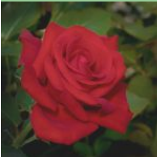
'DROP DEAD RED'