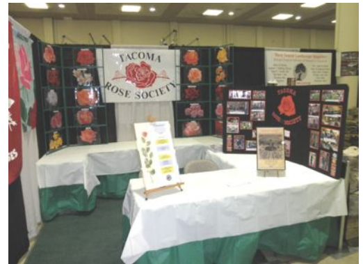
TRS BOOTH AT THE TACOMA HOME & GARDEN SHOW

THE PT. DEFIANCE BING CROSBY ROSE BED IS BEING REDESIGNED AND REBUILT