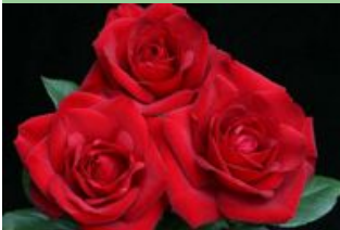
'ALWAYS & FOREVER' HYBRID TEA

crown so those new stems can develop for this year's growth. Now take a good look at those black canes and prune down until you see some apple green pith in the cut cane. You can go all the way down to the bud union if you need to.