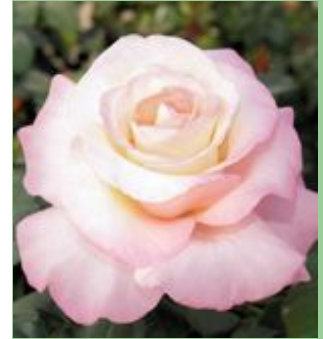
'CRESCENDO' HYBRID TEA