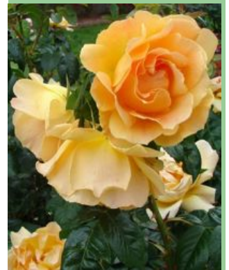
'EASY GOING' FLORIBUNDA