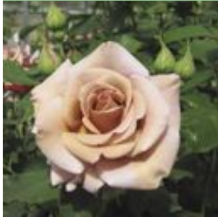
'KOKO LOCO' FLORIBUNDA