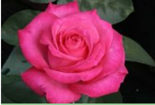
'LOVE'S KISS' HYBRID TEA