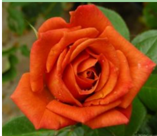
'PUMPKIN PATCH' FLORIBUNDA