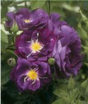
'RHAPSODY IN BLUE' SHRUB