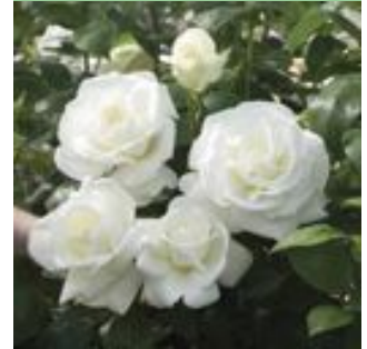
'SUGAR MOON' HYBRID TEA

A – Remove the mulch carefully to check, because you may find new growth -- look for buds that are swollen and beginning to show growth. Being covered they are mostly light green or white. This new growth is very easy to break off, which is why working carefully around the plant is important. You might want to remove the mulch as described above to expose the bud union which will allow warming and sunlight at the