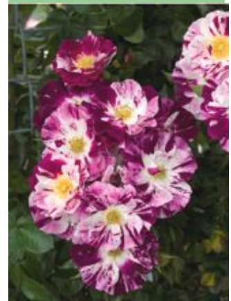
'PURPLE SPLASH' CLIMBER